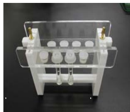
Gel setting (Also used as a gel casting unit)