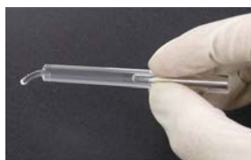
Gel slides down when removed.